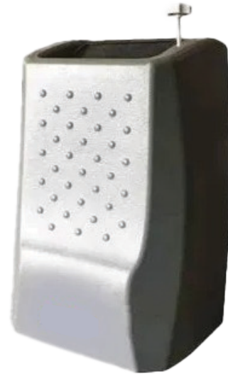
Build Foam Generator