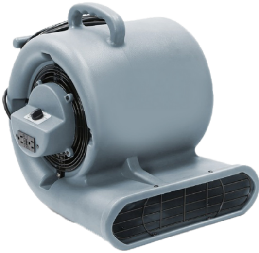
Carpet Drier Build-3 in 1 Blower