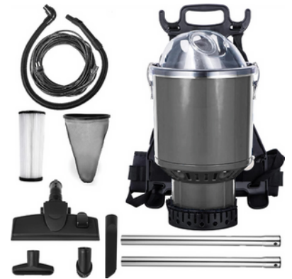
Backpack Vacuum Cleaner BUILD-B5