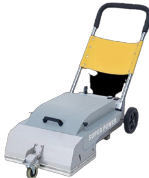
Build Escalator Cleaner Model Build-SC450