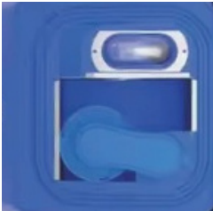
Sweage Equips with Full Water Device