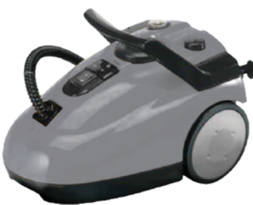
Build Steam Cleaner