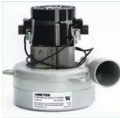
Imported Suction Motor X 2